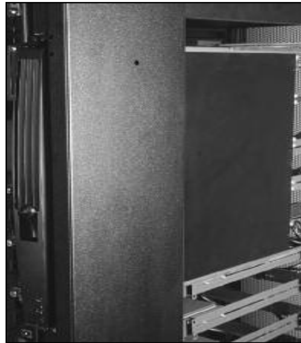
Close Up of CenterLine Installed